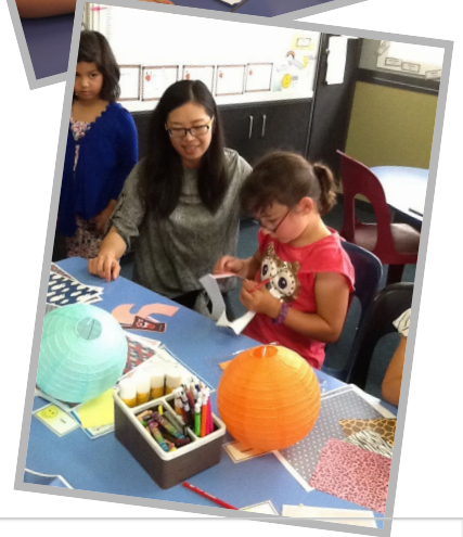
Room 1 students investigating vitamin C levels in Science. Room 8 students making lanterns for Chinese New Year.