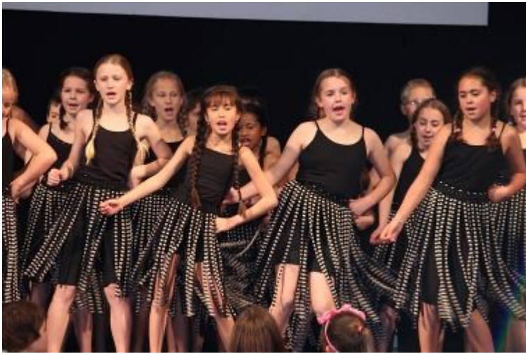
School Production—Kapahaka Group