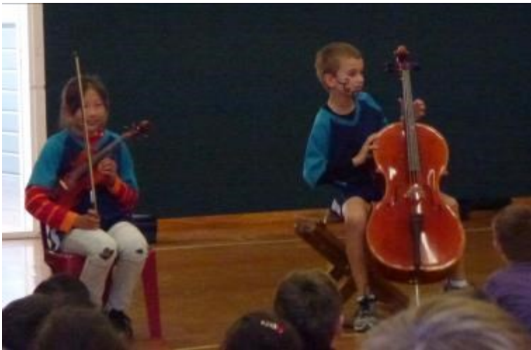
Sharing at assembly

Ka Tipu Pakari, Ka Tu Tangata, I roto i Tona Tai Ao.