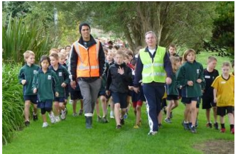
Hosting inter-school cross country